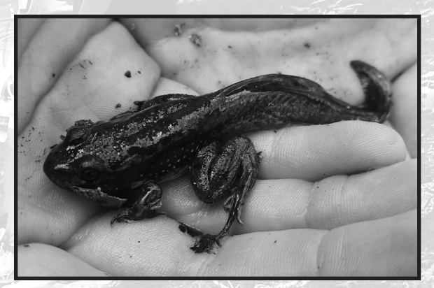
Educational programs of Kentucky Cooperative Extension serve all people regardless of race, color, age, sex, religion, disability, or national origin.